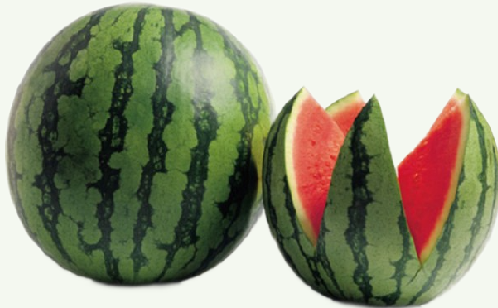
Varieties with and without seeds